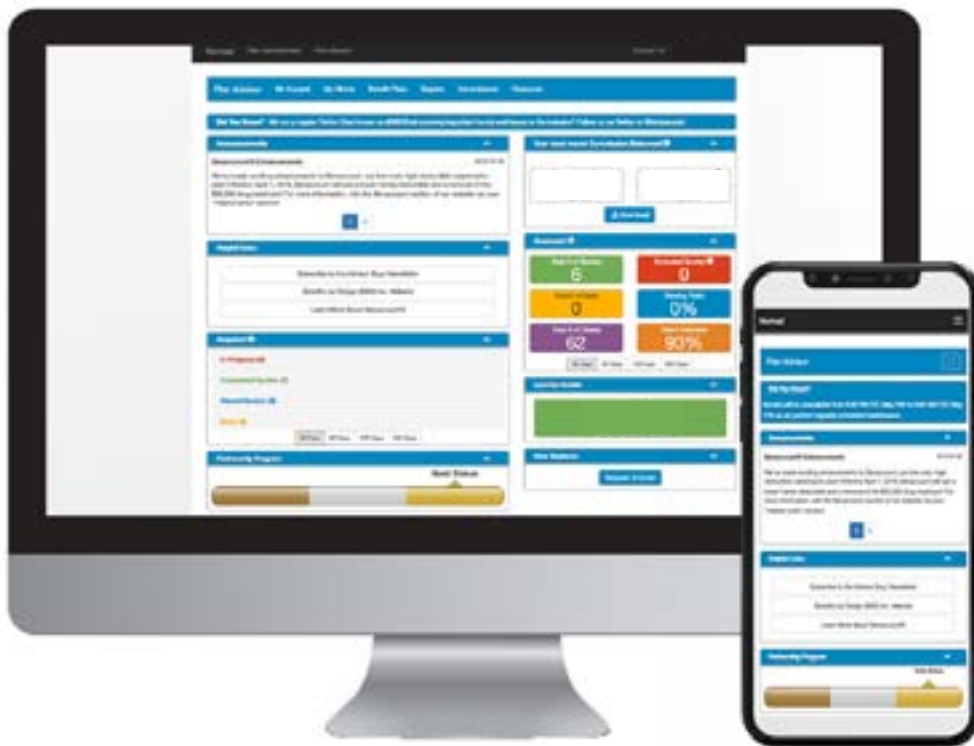
Nomad Advisor Portal

Our marketing materials are available electronically through Nomad.