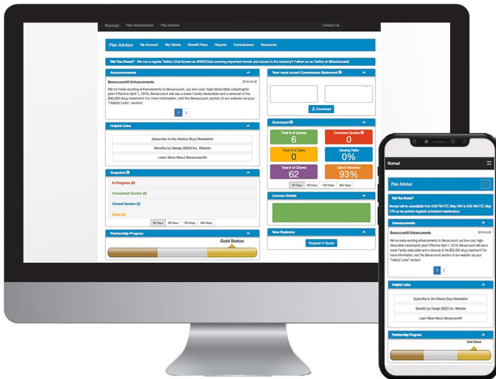
Nomad Advisor Portal

Our marketing materials are available electronically through Nomad.